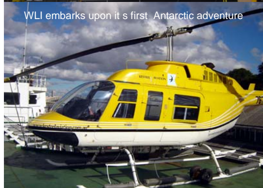
WLI embarks upon it's first Antarctic adventure